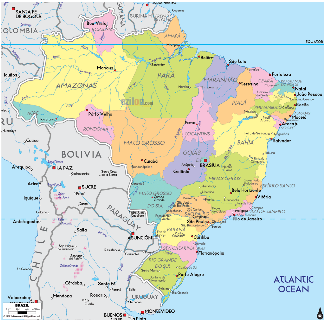
(Map of Brasil)

The aim of this article is to review the place and role of municipalities in Brazil's federalism and show how cities play an important role as part of the Brazilian Federation.